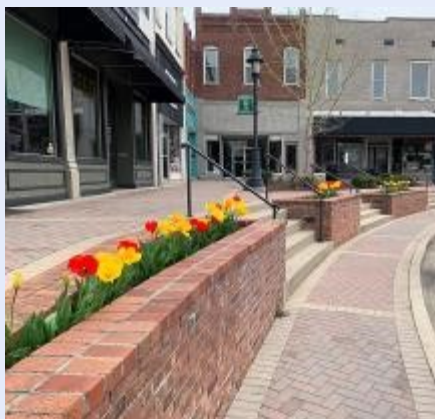
Spring has sprung in downtown Scottsville!

Tuesday, April 30, 2019 at 3:30 PM – 5:30 PM CDT