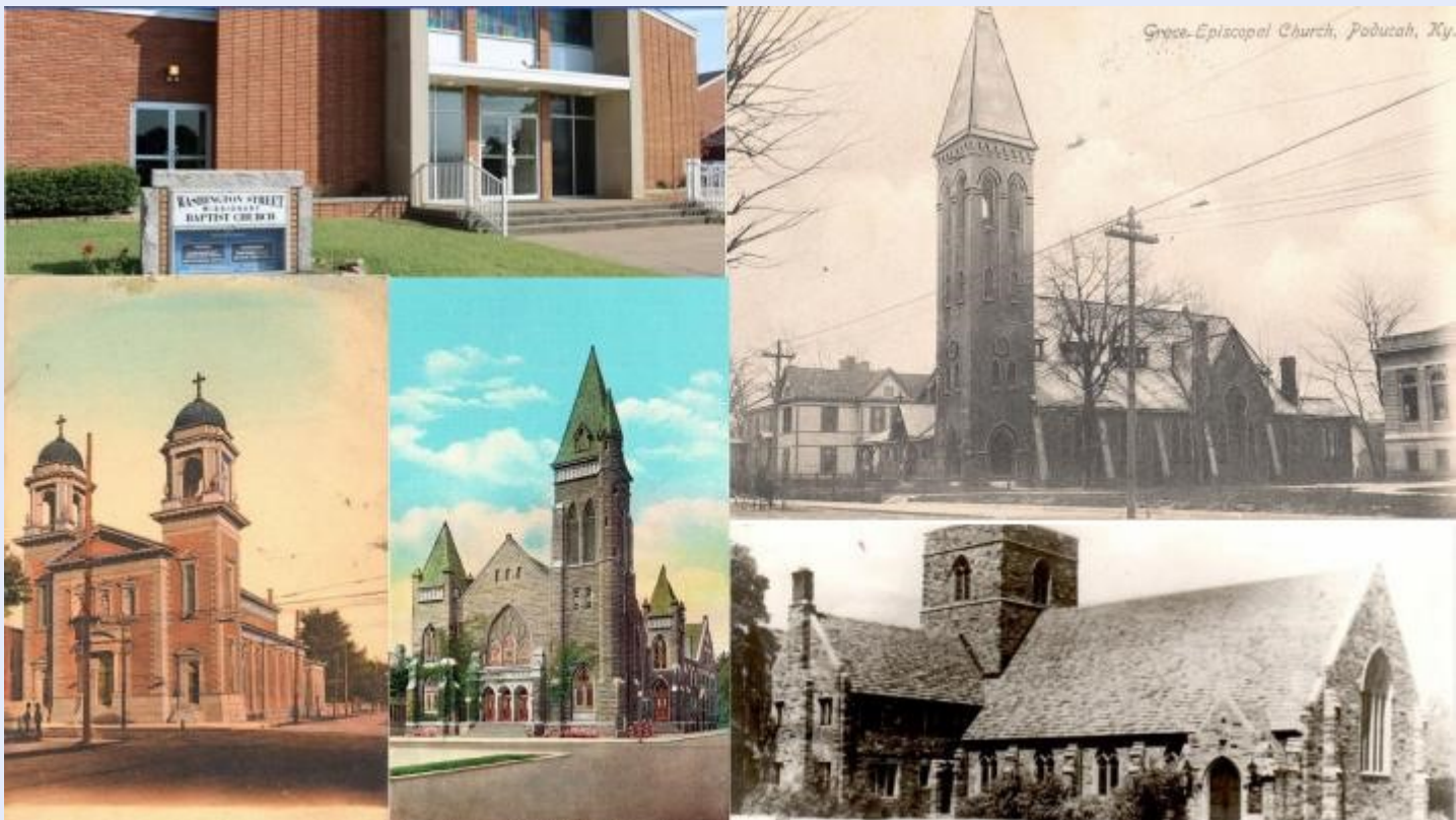
Adult Walking Tour in Paducah

Tuesday, April 30, 2019 at 3:30 PM – 5:30 PM CDT